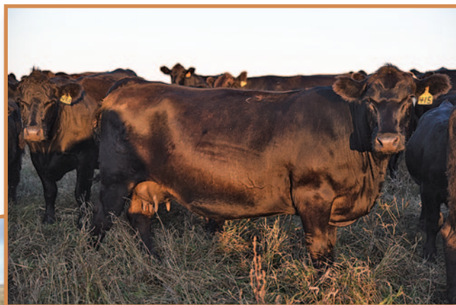
A B&B female, sired by In Dew Time and out of a New Design 878 female.